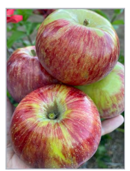
Apple Hill Season is Here!