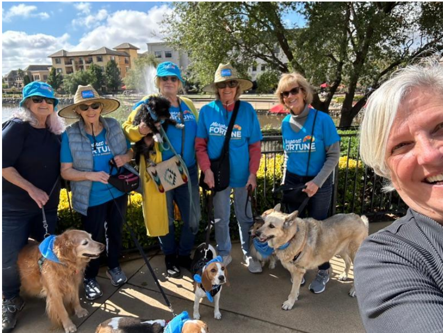
The Puppies 4 Fortune Gang (Join in Mondays in EDH, see flyer )